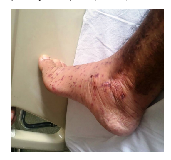
Figure 3 - Lower limb edema in a 26-year-old man victim of multiple honeybee stings in Macapá , Amapá , Brazil (authors' archive)