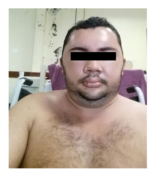
Figure 2 - Facial edema in a 26-year-old man victim of multiple honeybee stings in Macapá , Amapá , Brazil

Prognosis is usually good in patients who survive, and full renal function recovery occurs in most cases, and the